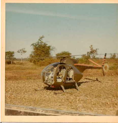
A visiting dignitary.jpeg (679x687)