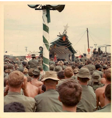
Bob Hope Xmas69.jpeg (682x688)