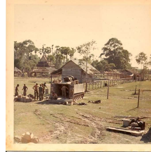
Jun.'70 in Cambodia.jpeg (679x687)

Apr.'70 on Cambodian border.jpeg | This pic is when we were on the cambodian border at the south vietnamese were trying a big sweep in cambodia to drive all the enemy into our waiting guns. washington denied anybody was in cambodia or on the border. the mission failed. the mama sans were waiting for us to sell their trinkets. i think everyone knew we were coming. (679x687)