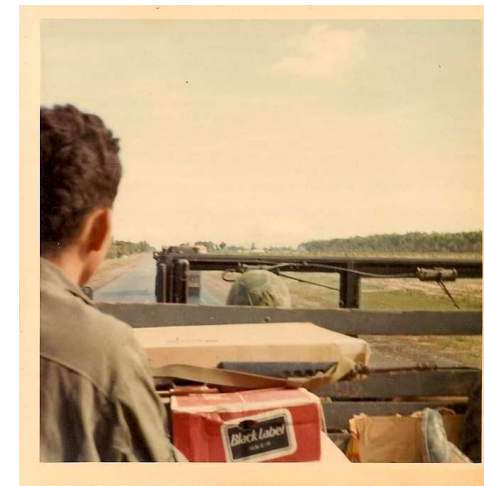
Important Supplies.jpeg (682x688)