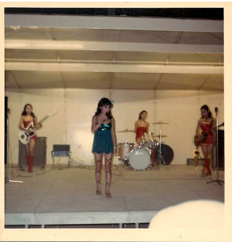
Standdown Entertainment.jpeg (682x688)