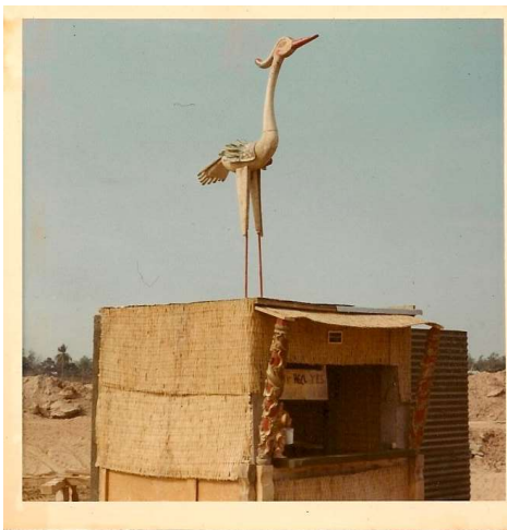
Beer Bldg. at Hampton.jpeg (682x688)