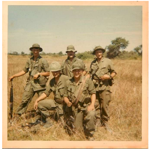
Mortarmen on Patrol.jpeg (682x688)