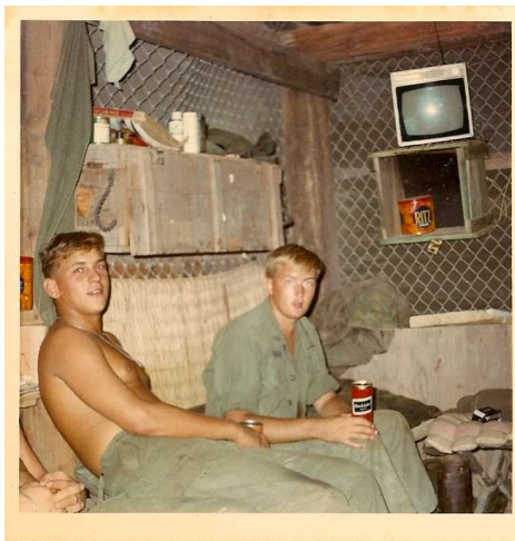
Roughing It.jpeg (682x688)