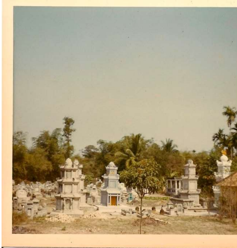
A scene in Cambodia.jpeg (679x687)